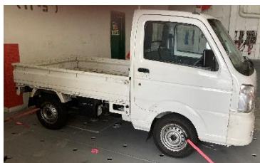
Used Mini Truck

"K" LINE will continue its efforts to reduce environmental impact.