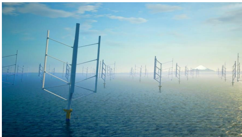
Artist's concept of a floating axis wind turbine (FAWT) wind farm

Electric Power Development Co., Ltd. (J-POWER), 1 Tokyo Electric Power Company Holdings, Inc. (TEPCO HD), 2 Chubu Electric Power Co., Inc. (Chubu Electric), 3 Kawasaki Kisen Kaisha, Ltd. (“K” LINE), 4 and Albatross Technology Inc. (Albatross), 5 have entered into a joint research agreement for a next-generation (floating axis) offshore wind turbine demonstration project (the “project”).